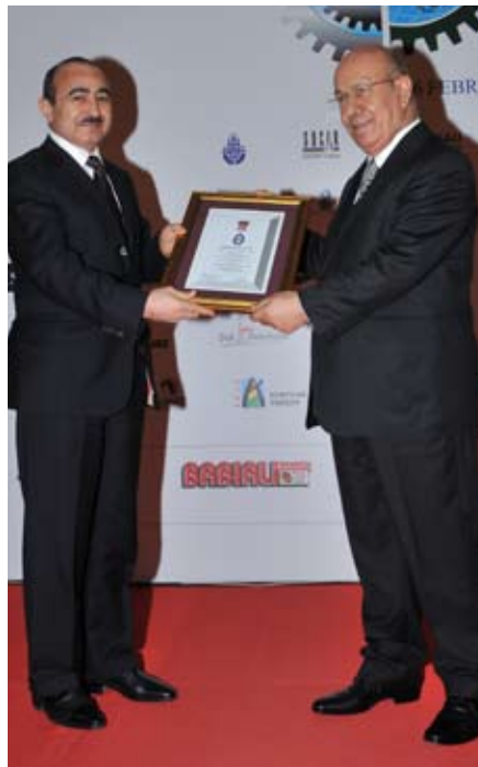
Hon. İbrahim Arıkan