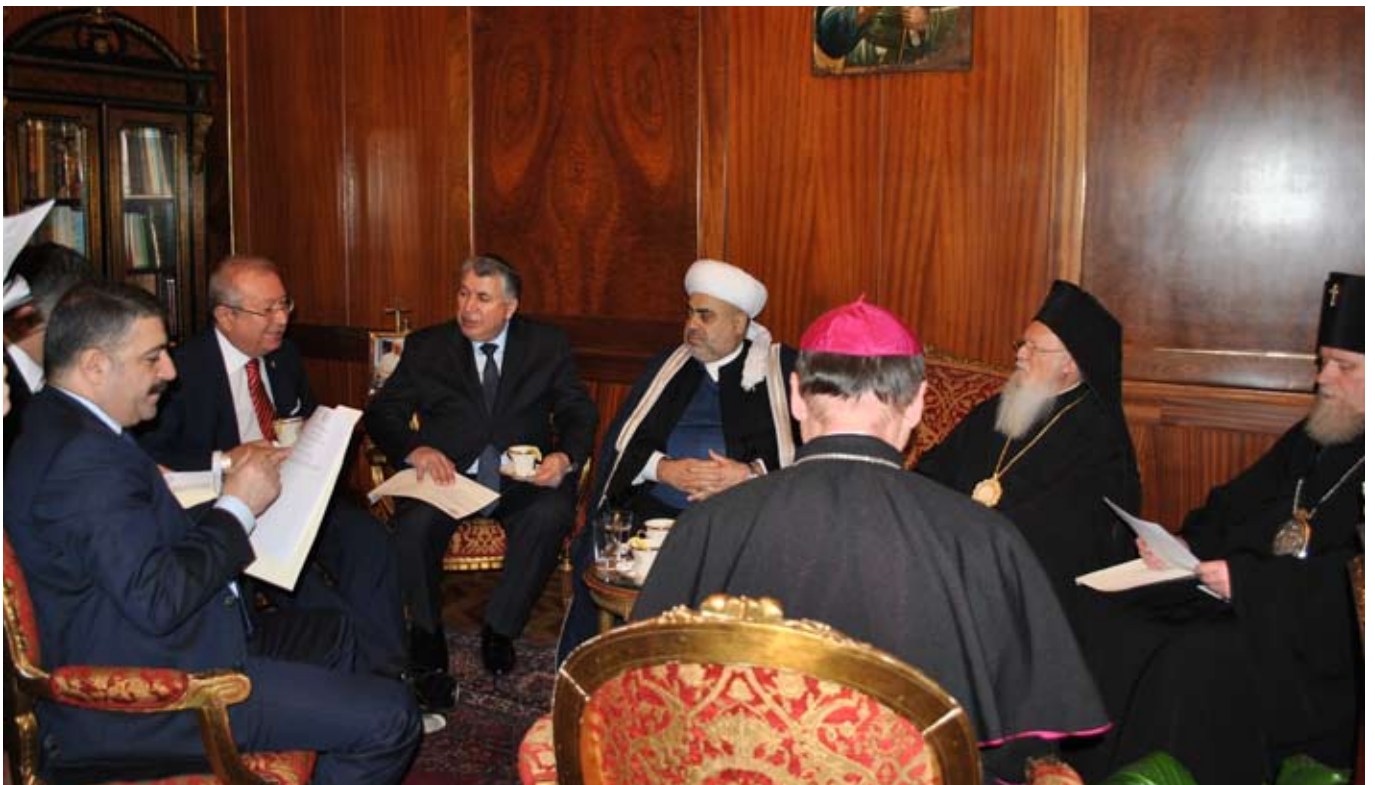
Religious Leaders of different faiths together

This is required for peace and safety of states. And also legitimacy is important for living in a peace. There should be international cooperation.