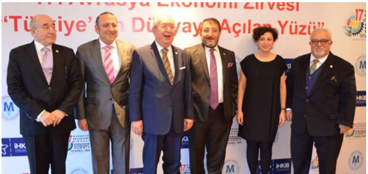
The creatives of the session of Interdisciplinary Approach to Technology and Design

Which firm that gathered technology and design is the most successful in Turkey and in the world? I thought and decide that the most successful company is Apple. Brand of Apple is an example. I-phones, I-pads, Google I-glasses exhibits serious performance.