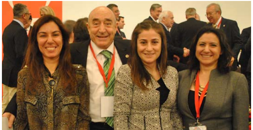
Hon. Lale Aytanç Nalbant, Hon. Engin Köklüçınar, Hon. Sevim Kulak and Hon. Munise Kaya

Eurasia needs peace and stability. Twenty years ago commerce with our close neighbor Greece was 200 million dollars. Today it is 25 billion dollars. Turkey is Greece's primary trade partner, before our doors were closed to one another.