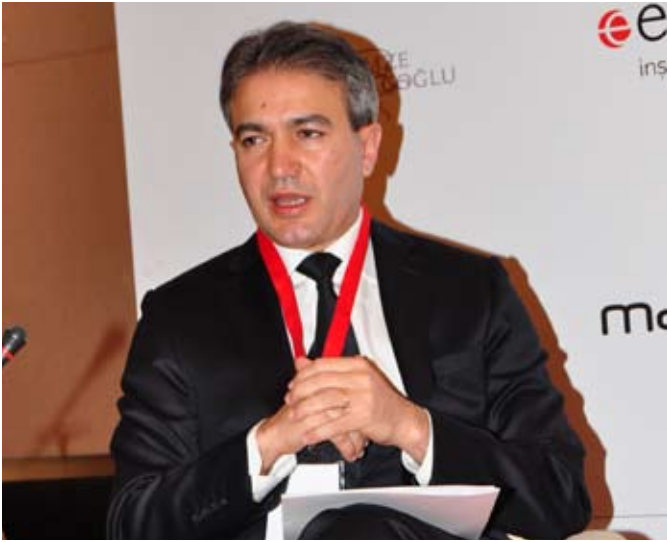
H.E. Emir Kır

Mayor of Saint-Josse-ten-Noode - Former Minister of State of Belgium