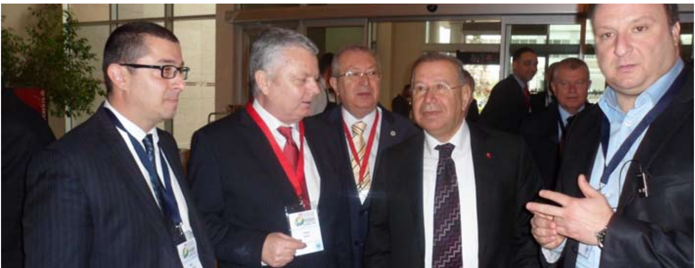
Participants of ICT for Development Session

International and regional cooperation is a great importance in a globalized world. We believe that this kind of events create new opportunities for solving the problems common to all of us. We also believe that this important summit on economic cooperation in the Eurasian region will be a great contribution to the expansion of the new cooperation and finding solutions for sustainable development. Once again, I wish success to the summit.