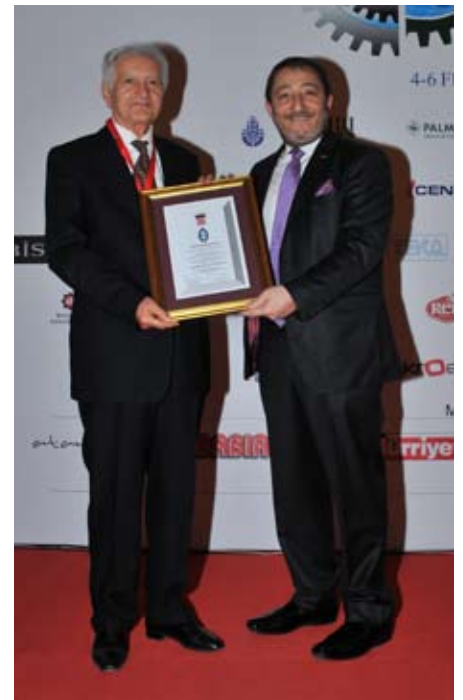
Hon. Mustafa Karagül