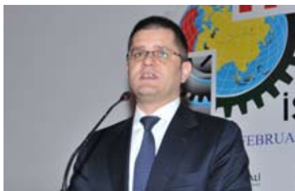
H.E. Vuk Jeremic Former Minister of Foreign Affairs of Serbia

At the end of the Opening Session of the 17 th Eurasian Economic Summit, Marmara Group Foundation signed partnership agreements with; Center for International Relations and Sustainable Development chaired by H.E. Vuk Jeremic and Hungarian Initiative Foundation chaired by H.E. Tamas Fellegi. The speech delivered by Former Minister of Foreign Affairs of Serbia H.E. Vuk Jeremic for this occasion is presented below: