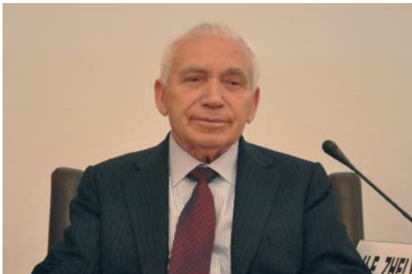
Zhelyu Zhelev Bulgaria

Combating trafficking in human beings is a priority for Bulgaria and one of the main State's actions against organized crime and crimes against the personality. Since the introduction of the crime "Human trafficking" in the Criminal Code in 2002, Bulgaria constantly and sustainably develops the anti-trafficking policies towards keeping legislation up-to-date with international and European standards, increasing penalties for the traffickers, doing effective prevention, protection and victims' support.