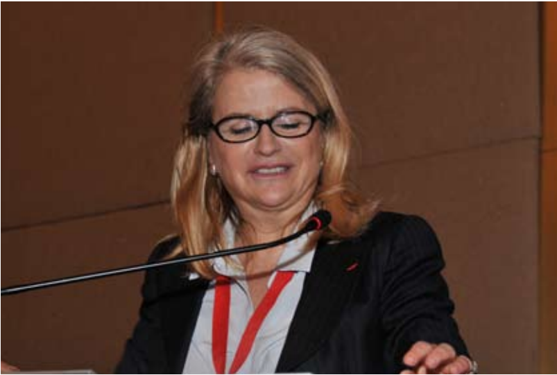
Hon. Joelle Garriaud-Maylam Member of French Senate

The UN Palermo Convention of 2000 gives us a detailed definition of human trafficking: “Trafficking in persons” shall mean the recruitment, transportation, transfer, harbouring or receipt of persons, by means of the threat or use of force or other forms of coercion, of abduction, of fraud, of deception, of the abuse of power or of a position of vulnerability of the giving or receiving of payments or benefits to achieve the consent of a person having control over another person, for the purpose of exploitation. Exploitation shall include, at a minimum, the exploitation of the prostitution of others or other forms of sexual exploitation, forced labor or services, slavery or practices similar to slavery, servitude or the removal of organs”.