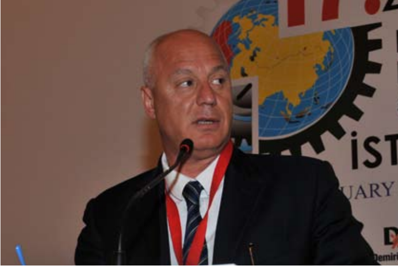
Hon. David Tsur Member of Knesset - Israel

After Ms. Violeta Bulc's speech I have almost nothing to add. So I will be very short. In Israel we are called as a start up nation mainly because a lot of start ups in innovation, technology specially on ICT because as a small country we believe we don't have any benefit or added value on the hardware and we are investing mainly on the people's minds. Science and R&D which we think are the most important issue that we can provide because this is the future. Everything is concerning in the growing market of ICT was already spoken before and Israel is a very very fast growing market on anything connected to the ICT, web, data but as I said we are very much focused on R&D.