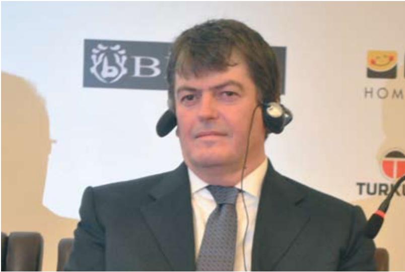
Bamir Topi Albania

Firstly I want to thank you for your invitation to this meeting, which I especially feel honored to be a part of because of the themes it is addressing, which are so important, as they touch on the politics of social and economic development and above all on the report of the developmental trajectories of the environment and resources, all placed within the context of, what figuratively could be called “our enemy”: time.