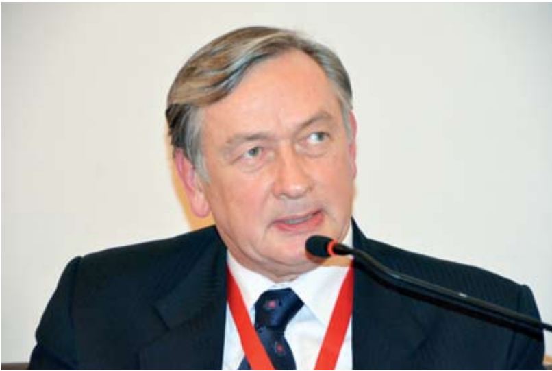
Danilo Türk Slovenia