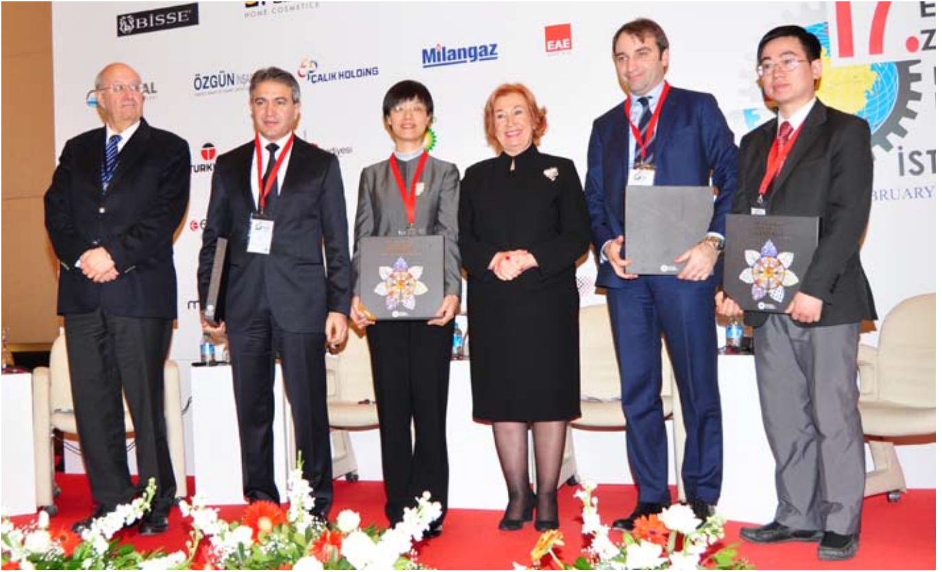
Family photograph with the participants of Change in the Local Government panel of the session.