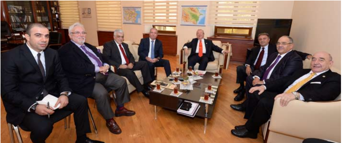
Marmara Group Foundation Delegation at H.E. Prof. Ali Abbasov's office.

very good results in e-governance making many online services available for public use.