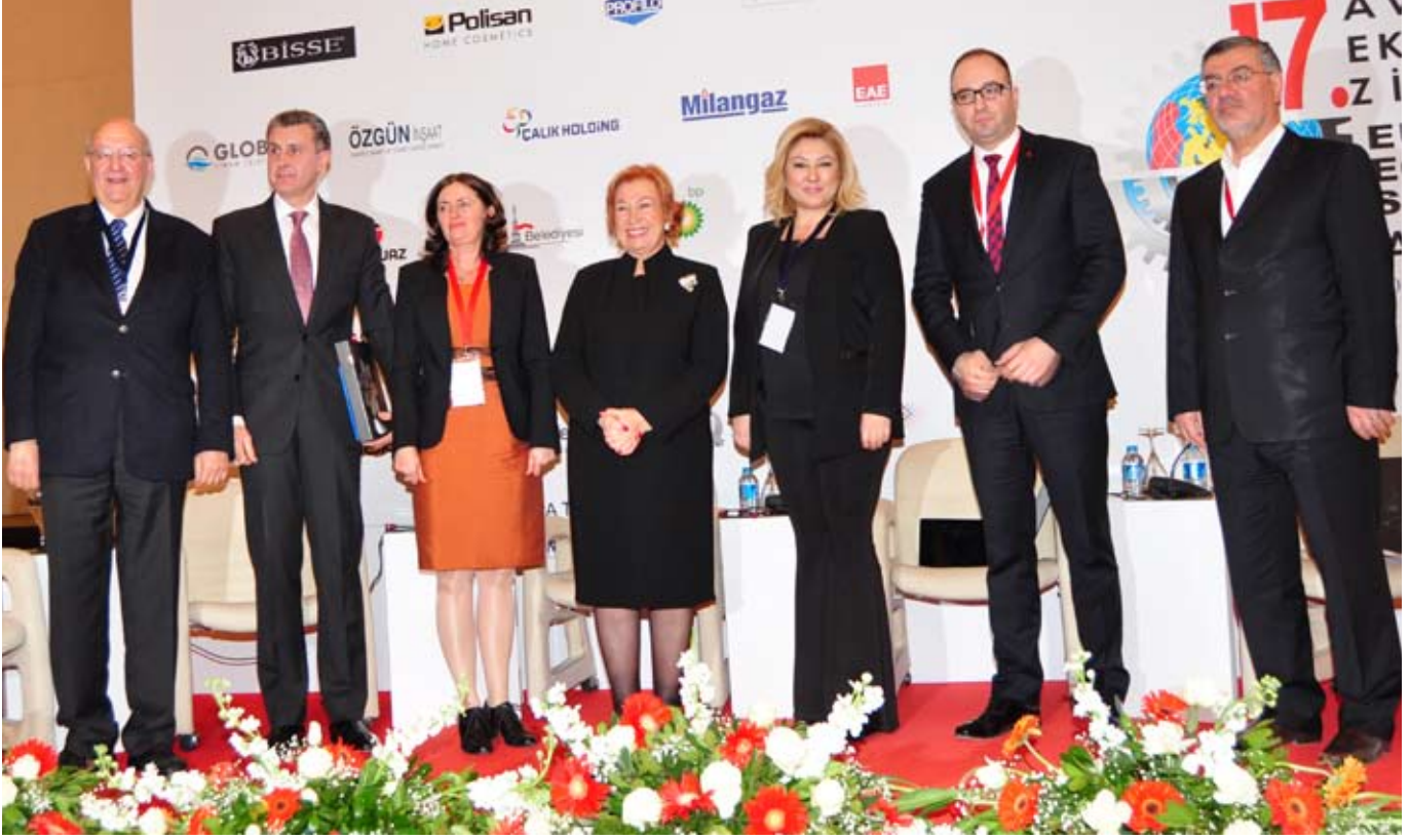
Family photograph with the participants of the Sustainable Development pannel of the session.