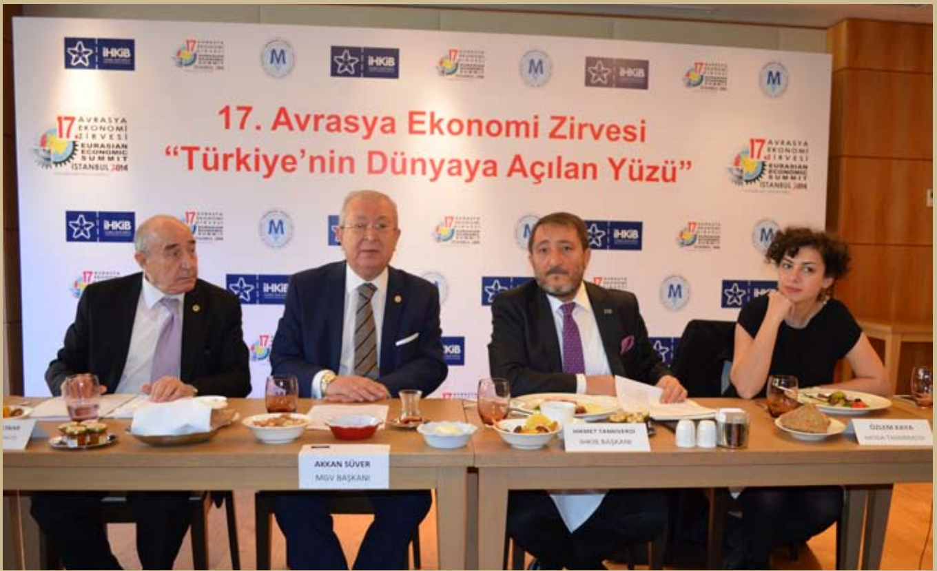
Press Conference on 17 th Eurasian Economic Summit