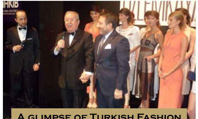
A GLIMPSE OF TURKISH FASHION AT THE GREAT EVENT OF IHKIB