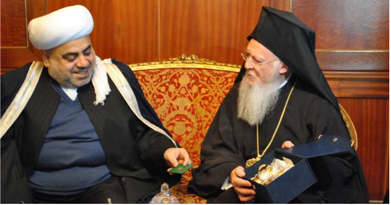
H.E. Shaykh-al-Islam Allahşükür Paşazade with His All Holiness Ecumenical Patriarch Bartholomew I

sacrifice. It demands of us a willingness to become people and communities of transformation.