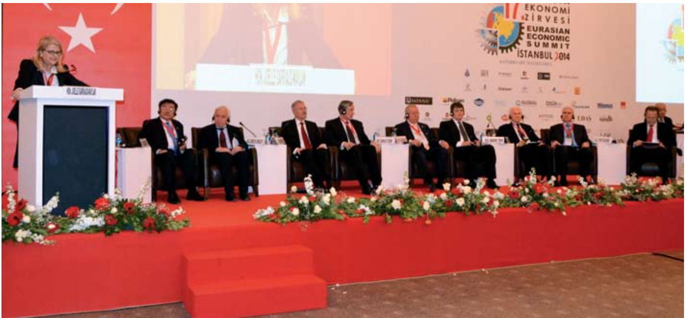
Hon. Mme. French Senator Joelle Garriaud-Maylam opened session of the Sagacious