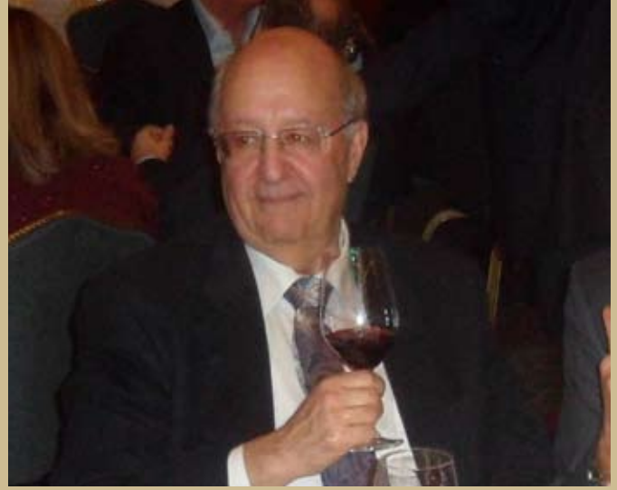
Hon. Prof. Ersin Kalaycıoğlu moderator of the Session of Sustainable Development and Change in the Local Government

Our municipality is one of the 19 municipalities of Brussel. It is located in the center of city. There are many