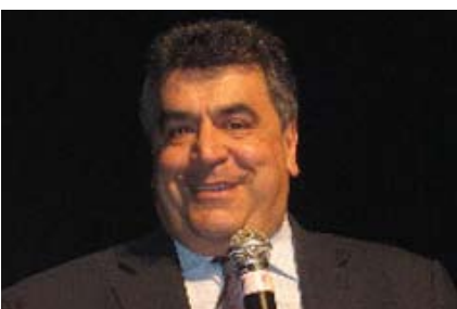
H.E. Ambassador Kenan İpek read the message of H.E. Minister of Foreign Affairs Ahmet Davutoğlu

I believe that Turkey's further hosting of the Summit in the coming years will serve the purpose of strengthening of country's role as a rising power in the center of Eurasia and as a stakeholder in the evolution of the international system. I present my respectful regards to all of the participants along with my hopes of a successful Summit.