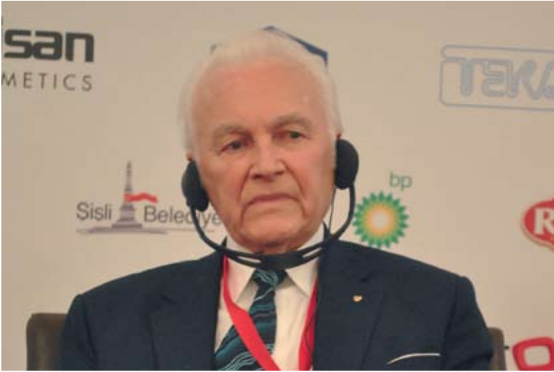
Arnold Rüütel Estonia