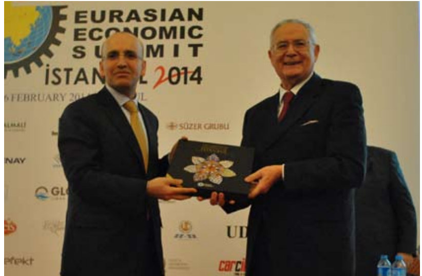
H.E. Mehmet Şimşek received his gift from H.E. Ertuğrul Kumcuoğlu

One of the basic problem areas of Turkey is "current account deficit". The current deficit is quite high in Turkey and it is need to decrease it. There are some permanent reasons that we named it as secular. Low savings and conjuncture position etc. For instance, Arab Spring has been negative factor. Economic crisis in EU countries have also been a