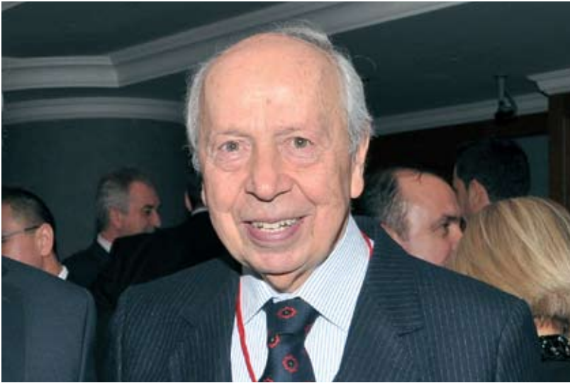
H.E. Lamberto Dini Former Prime Minister of Italy, Senator

When we look at the history of energy production, we see a cyclical pattern with one crisis after another being resolved by scientific and technological progress, which has continuously succeeded in closing the gap between the scarcity of natural resources and our capacity to produce.