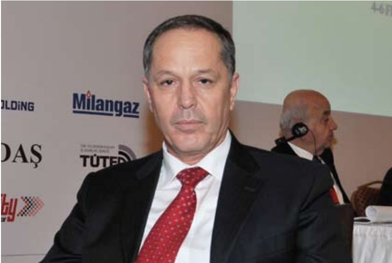
Mihail Formuzal Moldova

The importance of migration is increasing under the economic circumstances that have globalized in the second half of the 20th century and in the 21st century. In modern perspective, migration creates a lot of problems that require the agreement of all countries and the solution requires a global approach. Between 2008-2010 global economic and financial crisis escalated the problems like poverty, unemployment, social instability and caused an increase in the migration processes. Military conflicts and natural disasters experienced in the developing countries during the last decade resulted in returning back to feudalism age with its negative concept of human trafficking. Many ex-soviet countries are not exceptions with regards to increase in migration flow as with the cracking down of planned economy and developing of free market a lot of workers failed to find jobs in their own countries and forced to become immigrant workers. According to UN numbers, the total immigrants in the world are 230 million people. Immigrants make up for the %10,8 of the developed countries population whereas this number is only %1,6 in poor countries.