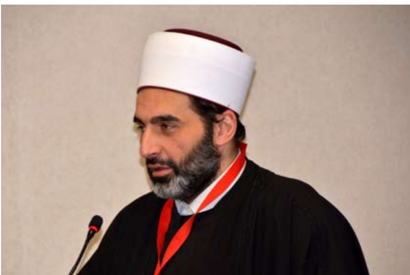
H.E. Muhammed Jusufspahic Mufti of Serbia

The God created people as social. People can only live in society. Religious Leaders are important for people. Religious leaders should be democratic and tolerant. They directs people useful way. For that reason the election of religious people is important for all human being. Religious leaders should be a model to people.