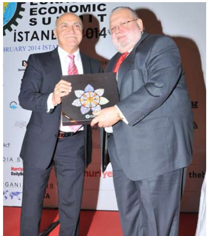
H.E. Valeh Aleskerov received his gift from Hon. Aykut Eken

Furthermore, when we look at the last 10-15 years we see that the most increased use of energy source is coal. The most efficient source of pollution. This doesn't seem to be compatible. On one hand we speak about cleanness, on the other hand.. When I say this, people tell me that it is increasing in China, in India. Yes the most increase in coal use in China, in India. But also in Europe, in 2012 the electricity production by using coal in Europe increased by %12. How come? At the same time gas is a cleaner source of energy. The carbon emission of gas is %50-60 less than coal. I am sure that if the %30 of the support given to solar energy, wind energy or any other renewable energy has been given to gas , many problems in Europe, Eurasia would much easier to solve today. Who is giving the extra money? United States is giving. Where does the state's money come from? Not pouring down from the sky. From the pockets of the citizens. And accordingly if the political support was to given the exposure of the gas industry, a lot could have changed in the future of the world.