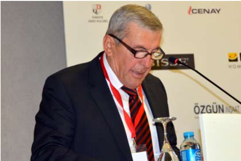
H.E. Jusuf Kalamperovic Former Minister of Interior of Montenegro

Peace cannot be achieved on a planet ravaged by pollution, hunger, poverty and disease, which are a major cause and effect of global environmental problems. Peace dialogue for local and global development therefore needs to deal with environmental problems within a broader perspective that encompasses the factors underlying world poverty and international inequality. Many development efforts for economic progress are structured to meet human ambitions and are simply non-viable. They draw too heavily on environmental resources and future generations will inherit the losses. Responsibility for the transition to a new society does not only lie with our leaders. We all can and should be involved. This Eurasian Economic Summit, with its most distinguished international impact, can set the framework for reforms and strategies that can infuse new thinking and new ideas for the participation of every citizen in a global dialogue for peace. Through a constructive exchange of views, with a thesis, antithesis and synthesis of new values, we can mobilize world leaders and humanity's collective talent in order to lay the needed groundwork for change. This is the goal and essence of "biopolitics."