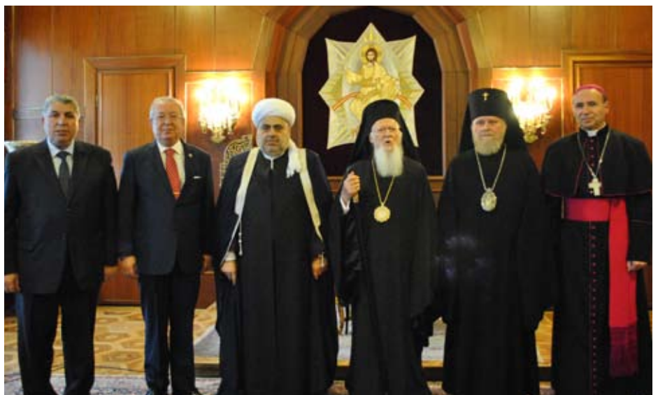
Religious Leaders at the Patriarchate

Once again, I wish a beneficial Eurasian Economic Summit and present my thanks to Honorable President and participants.