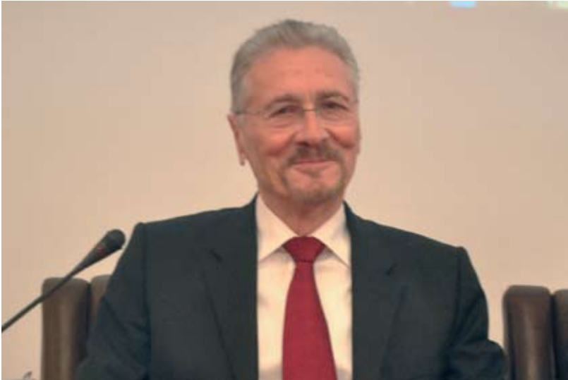
Emil Constantinescu Romania

H uman trafficking is the modern name for slave trade; it is a century old social practice, accepted during some historical times through written laws or customs. If states' modernization and democratization led to slavery abolition starting with 13th to 19th centuries, the situation of sexual exploitation of women and children or forced labor imposed to some people recruited through fraudulent lies meant to be sold in order to obtain profit is different.