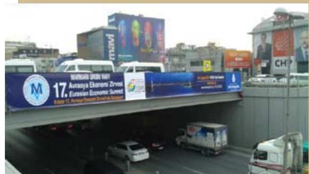
Bilboards prepared by the Istanbul Metropolitan Municipality in the alleys of Istanbul

We live in a world where the male employers are being paid more than their female counterparts and women are more prone to firing than men in times of economic crisis. I think this is a matter of mentality on top of everything. To fight with this mentality is not only women's job but all of ours. We must achieve it together for a sustainable world.