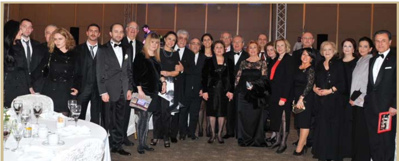
A group from participants

well. I want to state one critically important issue of the 21st Century. That is usage of energy and climate change. Today energy is one of the most important political commodities. Energy brings geopolitical issues along with economic ones. That is why Turkey is an important actor in Europe's energy stability and independency. Turkey is a country that can unite the countries of Caspian, Middle East and Europe. Turkey will have an important role in enrichment and diversification of energy resources. We will need to change our ways of using energy. The reach, usage and distribution of energy is very limited at the moment and this can create problems for the future generations. As Hungary we are ready to cooperate with Turkey. We are also ready to make cooperation with other countries in the region. I think Hungarians and Turks are ready to build a common future based on their common past. As Hungarians, we support Turkey's full membership to the European Union and we believe Turkey will be a very active country in the region.