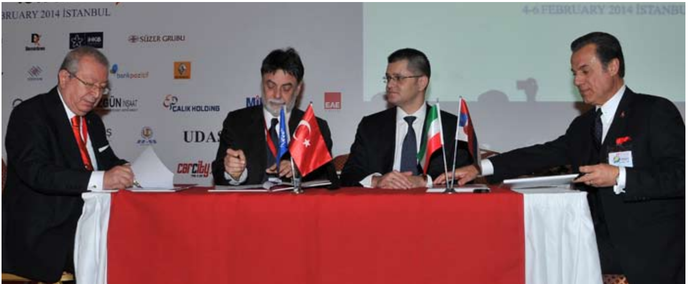
Parties during the Signing Ceremony

fluctuated—going up and down at predictable intervals. This variability has been due to the natural variations of the Earth’s orbital movements. But for the last 100 years, the CO 2 concentration has been increasing exponentially—to the highest level since before the dinosaurs roamed the Earth.