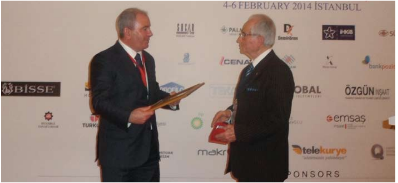
Hon. İsmail Hakkı Demirci