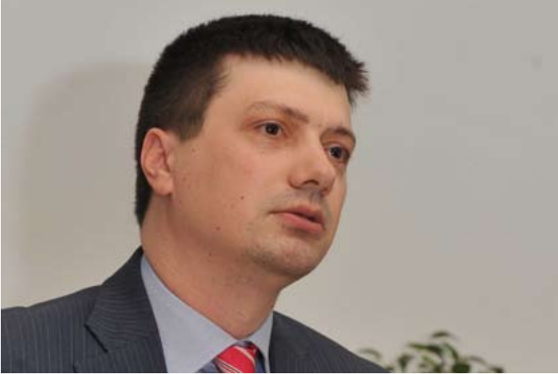
Hon. Ionut Vulpescu Member of Parliament of Romania

We have all noticed how inspired is this panel's title: peace is not only an everlasting desideratum of the mankind, phrased as an imperative in all religions and assumed by the great majority of political leaders, but also a result of the dialogue between local and global.