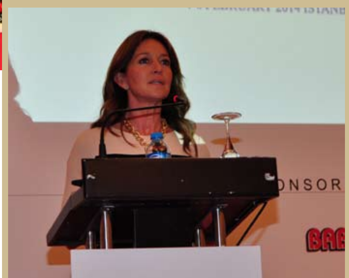
Hon. Tijen Mergen gave a speech at the opening ceremony