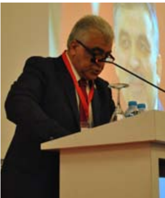
Hon. Şamil Ayırım conveying H.E. President Abdullah Gül's message

With this regard, I wish that the ideas and suggestions that will appear as a result of efficient debate environment provided by the Summit and through the realization of common rationality to be serve as a guidance for the prosperity and peace of all the nations of Eurasia and whole humanity. I wish you all the success in your efforts.